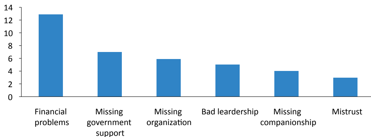
Figure 1 – Mentioned reasons for the failure of agricultural cooperatives and associations.

which is lack of capital, occurred after CHESF stopped the regular payments, contextualizing its background in the history of the cooperatives' implementation. The experts